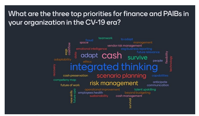
Meeting Poll Results

Advancing business partnering in the remote working environment also involves having greater confidence in advising business partners in virtual meetings, maintaining connections and engagement, and more frequent communication within the finance team to keep finance staff fully engaged and motivated.