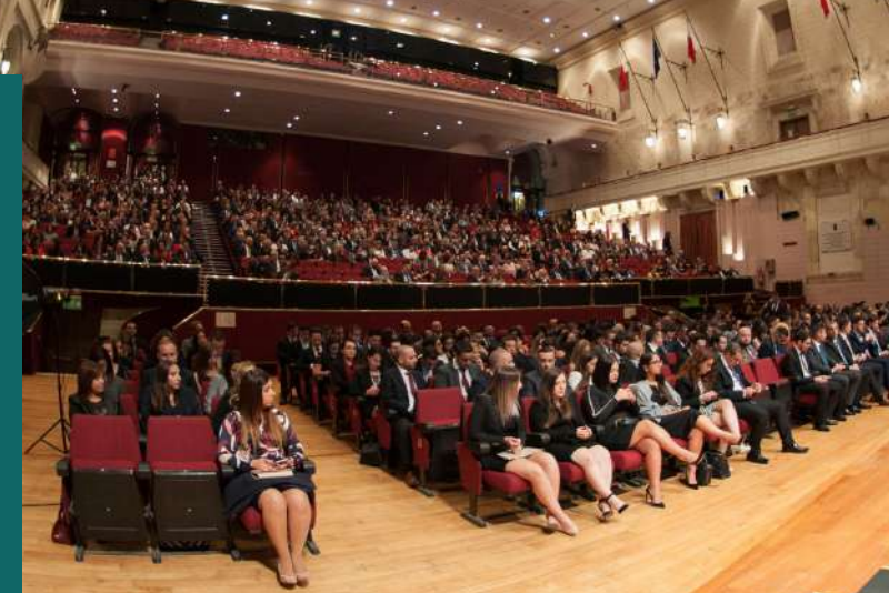
The New Members' Ceremony

The ceremony was attended by around 900 people including new members and their guests. Present at the ceremony were representatives of the Association of Chartered Certified Accountants (ACCA), University of Malta, and the Institute of Chartered Accountants in England and Wales (ICAEW), being the three main routes to membership with the MIA.